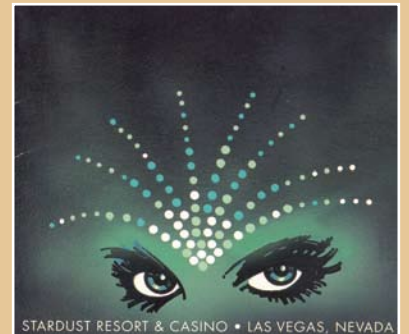
STARDUST RESORT & CASINO • LAS VEGAS, NEVADA

History/Local, State ISBN-10: 1-932173-70-6 ISBN-13: 978-1-932173-703 12 x 9 in., 186 pages $39.95 Hardcover Stephens Press, LLC